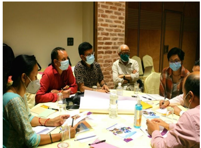
Picture 3 Participants discusses on the given themes during the group discussion during the workshop.

NNSM organized a policy forum workshop on Joint Action to Combat Human Trafficking in the Foreign Labor Migration Process, on August 13, 2021 in Kathmandu. The objective of the workshop was to disseminate findings of the thematic monitoring report titled "Situation of Foreign Labour Migration and Services in Local Governments" conducted by NNSM in 2020. The monitoring was carried out in Kathmandu, Makawanpur, Banke, Rupahdehi, Kailali, and Kanchanpur districts. Altogether 26