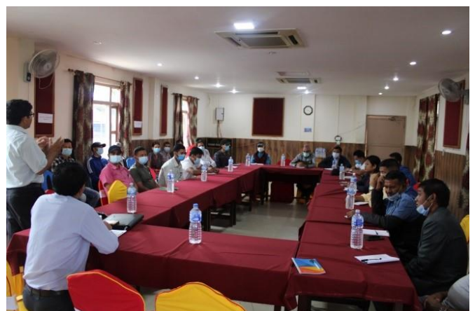
Picture 11 Participants attend the interaction program organized by NNSM with support from Solidarity Center.

NNSM with support from Solidarity Center organized Provincial level interactions at Butwal of Lumbini Province; Surkhet of Karnali Province and Dhangadhi of Sudurpashchim Province in September 2021.