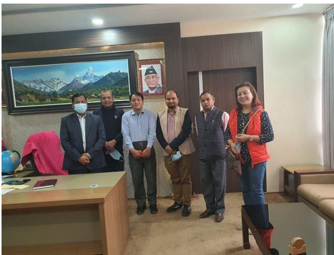
Picture 6 NNSM team visited the MoLESS and held a meeting with Honorable Gauri Shankar Chaudhari, Minister

NNSM delegates visited the Minister for Labour, Employment and Social Security honorable Gauri Shankar Chaudhari, on April 13, 2021.