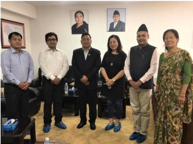
Picture 8 NNSM met with Right Honorable Vice President Mr. Nanda Bahadur Pun on August 10, 2021 at the Office of the Vice-President.

NNSM met with Right Honorable Vice President Mr Nanda Bahadur Pun on August 10, 2021 at his office. During the meeting delegates from NNSM discussed the contemporary issues of foreign labor migration