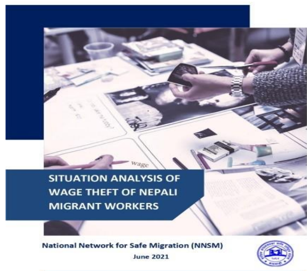
Picture 9 NNSM carried out the study on wage theft with data support from its member organizations PNCC, People Forum, Pourakhi Nepal and AMKAS Nepal and published a report.

Thousands of Nepali migrants working in various destination countries suffered from COVID-19 pandemic. Nepali workers in the Gulf countries, Malaysia, and other destination countries have also been directly affected by the pandemic. On the one hand, Nepali migrant workers were at risk of Coronavirus