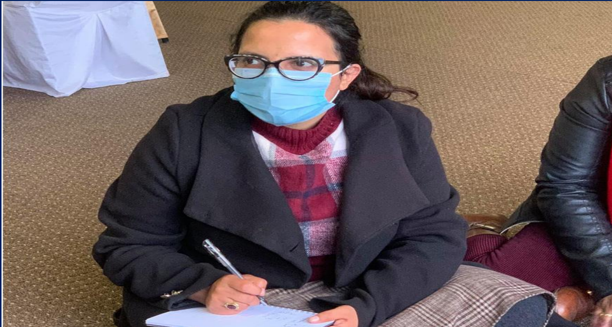
Picture 5 Participants engage in team work during 3-day Refresher ToT.

Participants also learned about the stakeholders for foreign labor migration and existing policies on the matter. NNSM also shared its advocacy strategy with the participants for them to develop their own organizational advocacy strategy. NNSM has committed to extend support in the development of advocacy strategy of all member organizations.