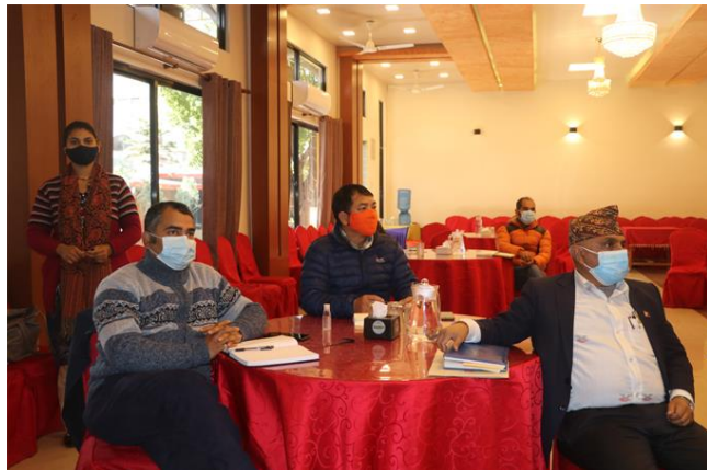
Picture 3 NNSM organized an interaction program on Localization of Palermo protocol on Dec 22, 2020.

To mark a week-long celebration of International Migrants Day, 2020 NNSM organized a semi-virtual interaction program on the issue of Palermo Protocol on Dec 22, 2020. This protocol titled “Protocol to Prevent, Suppress and Punish Trafficking in Persons Especially Women and Children”, supplements the United Nations Convention against Transnational Organized Crime. This is an important milestone which was adopted and opened for signature, ratification and accession by General Assembly resolution 55/25 of 15 November 2000.