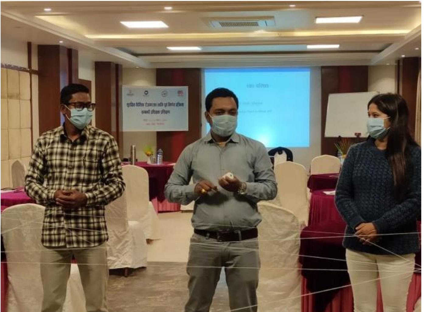
Picture 1 Participants are engaged in group work during the session in ToT held in Nepalgunj.