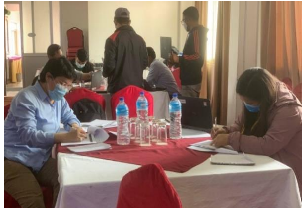
Picture 2 Representatives from network members participated during the PECAN.