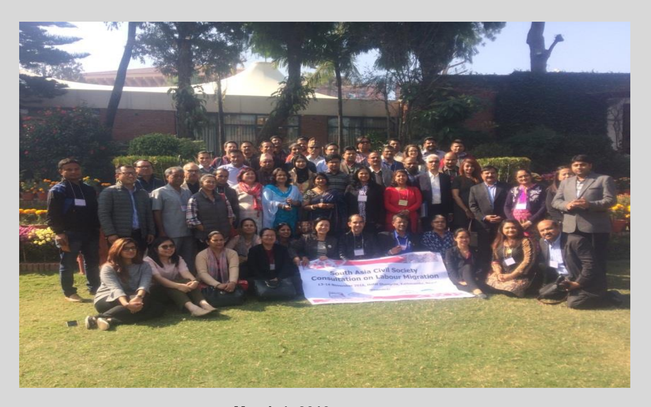
March 1, 2019 Kathmandu, Nepal